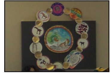
A circle of various Asian symbols created by the Art Therapy group.

We have added new programs such as Breakfast Program and an Expressive Arts program that is a fusion of visual art and movement and Music Workshops that will encourage writing lyrics, learning the history of instruments and group instructions to play instruments.