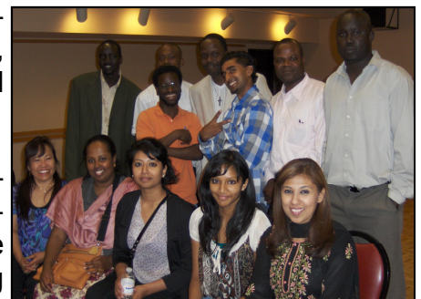
Youth participants and staff of PHAC project

On June 29th, 2010, Phase I of the project, celebrated a major milestone of the project with a "graduation ceremony" for the youth advisory group at the North York Civic Library. The event highlighted the contributions of all the youth involved in the project, through finalizing of the intervention Mind Matters from Australia, and they were presented with certificates to commemorate their participation.